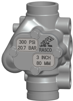
Model E3 - Grooved x Grooved